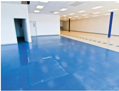
Interior of suite 101 from main entrance