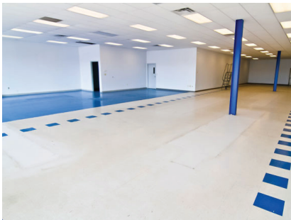
Interior of suite 101