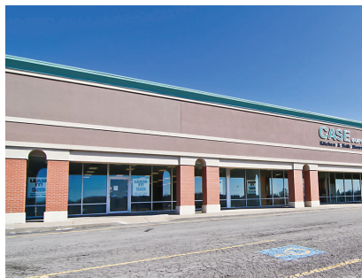
Main facade of Suite 101